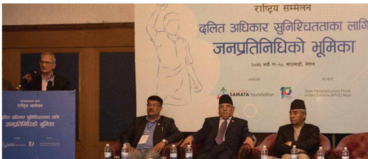
Three former Prime Ministers expressing their views

The last session of the first day event ended with province wise group division for learning and sharing the experiences which consisted of all the members of the national assembly, House of Representatives, province assembly, District Coordination Committee, Mayor/Chair and Deputy Mayor/Chair of Municipalities and Rural municipalities. Each group discussed about the common issues faced by elected Dalit representatives, their possible solutions and the challenges to the solutions. Some of the major issues and solutions are listed below province-wise.