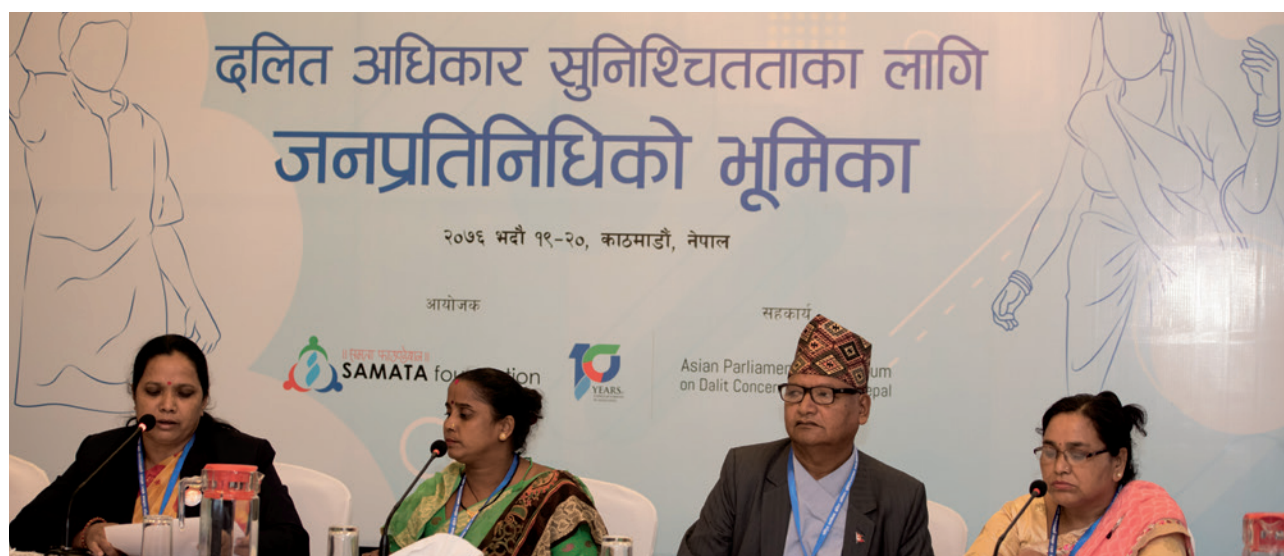
Elected members from provinces as panelists

This conference has set a genuine Foundation for continued future policy dialogues among the Dalit parliamentarians and elected members within their respective provinces and across the provinces.