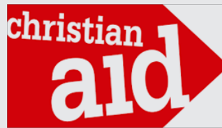
Christian Aid Nepal